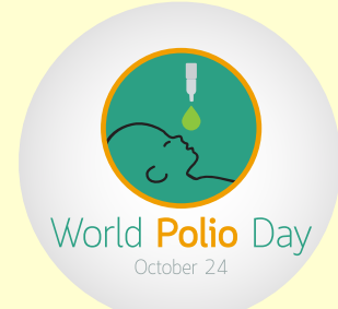
World Polio Day poster.

A certificate will be awarded to each student submitting an entry of scientific merit. The results, winning entries and a report of the competition will be published on the MiSAC web site competition pages www.misac.org.uk.